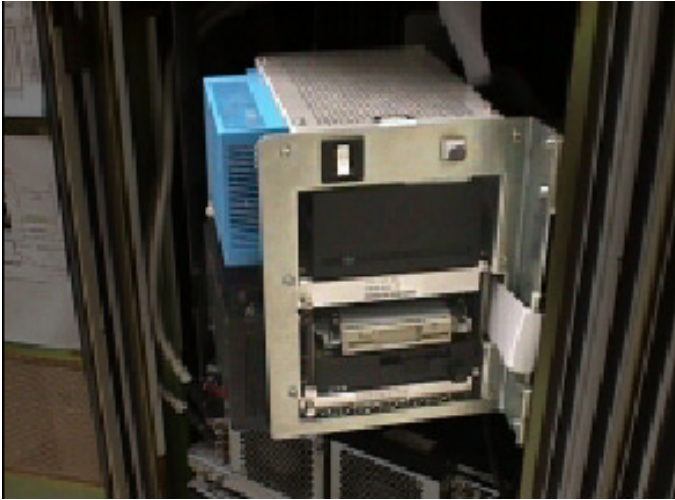
SPX-200 Hard Drive, Floppy, Cassette Tape, and controller unit; replaceable with the ASPX Emulation System.