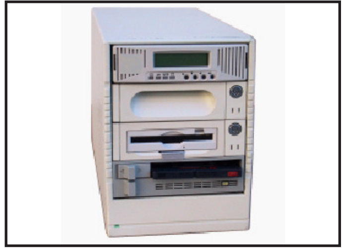
ASPX Emulation System mounted in a table-top cabinet. Unit is shown with control unit (top to bottom), removable SCSI hard drive, Magneto Optical drive, and Data Cassette tape drive. Unit is available with any combination of SCSI devices.